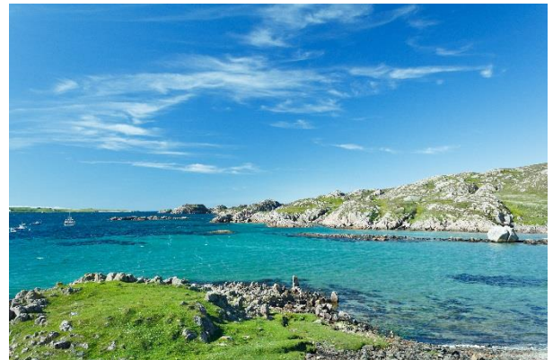
From top: White-tailed Eagle, European Otters & Fionnphort, Mull.